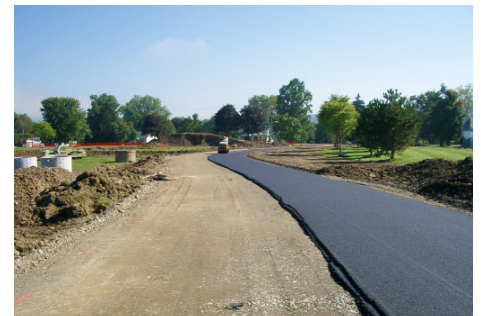
Woodbrook Assisted Living Town of Southport, NY