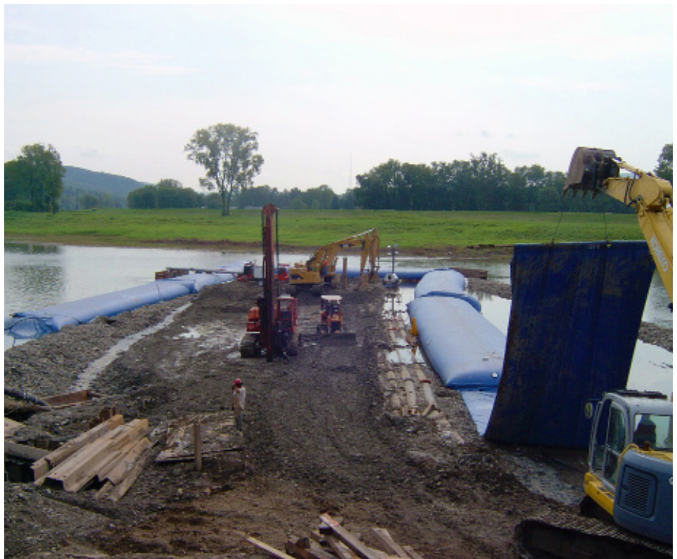
Chemung County Sewer Districts Chemung River Siphon Crossing, City of Elmira, NY