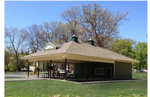
Grove Park Pavilion Site Design City of Elmira, NY