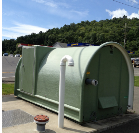
Chemung County Sewer Districts Wygant Sewer Pump Station Town of Horseheads, NY

FE is retained by several municipalities to provide engineering services for their annual paving programs. FE's scope of services typically includes estimating contract quantities, analysis of existing pavement conditions, technical support on project improvements, and construction inspection services.