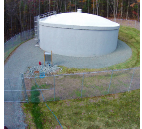
East Corning Water Districts 0.53 Million Gallon Tank Town of Corning, NY