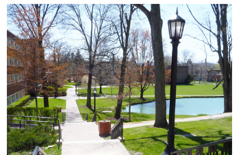
Elmira College Pedestrian Improvements City of Elmira, NY