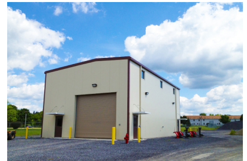
Town Highway Truck Wash Facility Town of Horseheads, NY